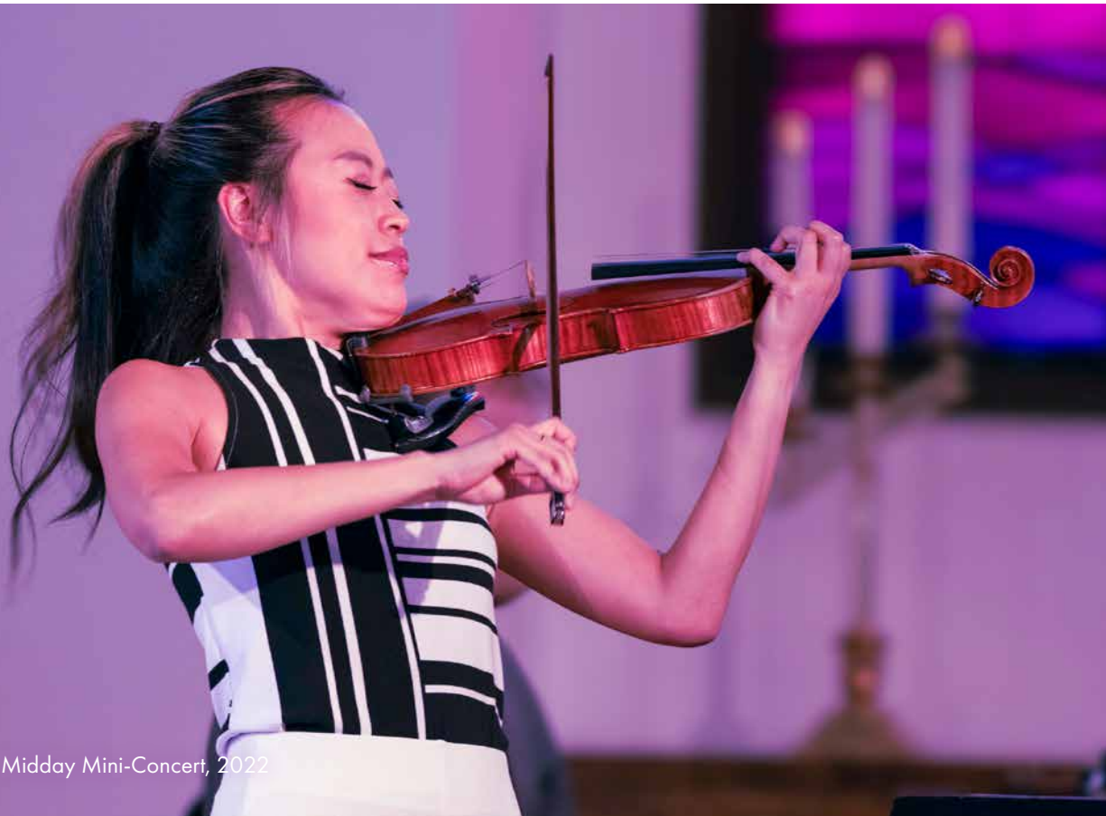
Midday Mini-Concert, 2022