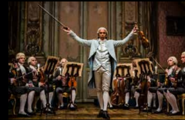
Chevalier MON, JULY 22, 2:00 PM Palm Theatre, San Luis Obispo

Festival Mozaic is proud to partner with the SLO Film Festival to present two film screenings during the Summer Festival.