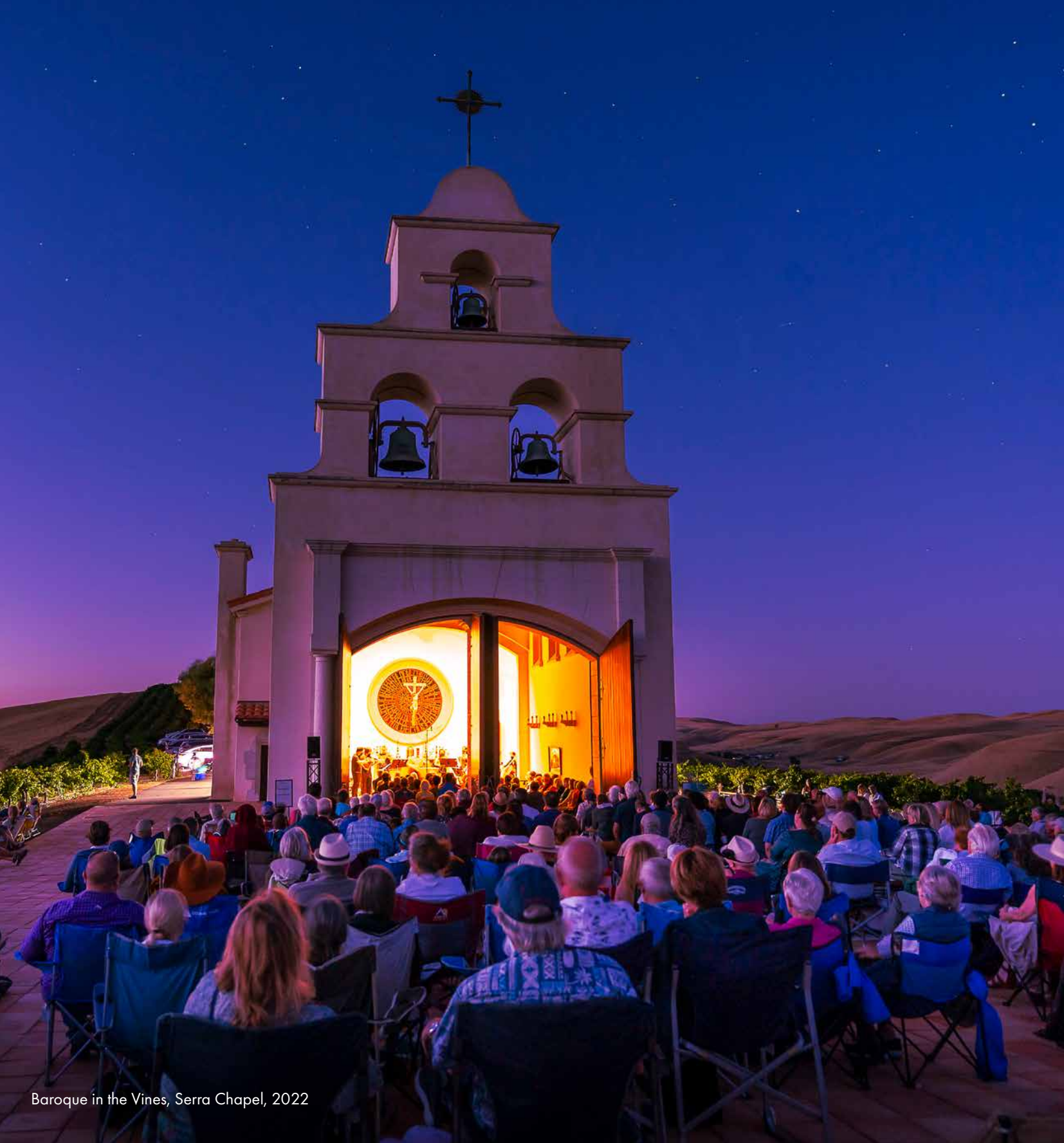
Baroque in the Vines, Serra Chapel, 2022