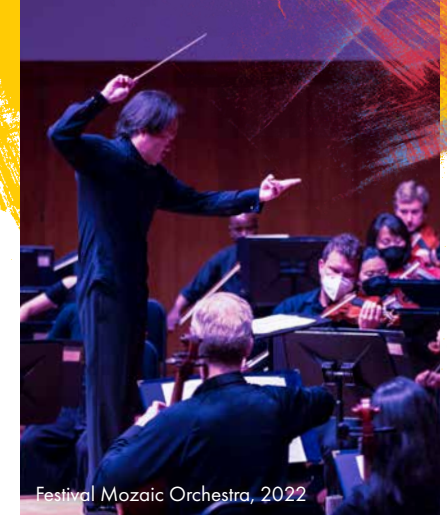
Festival Mozaic Orchestra, 2022